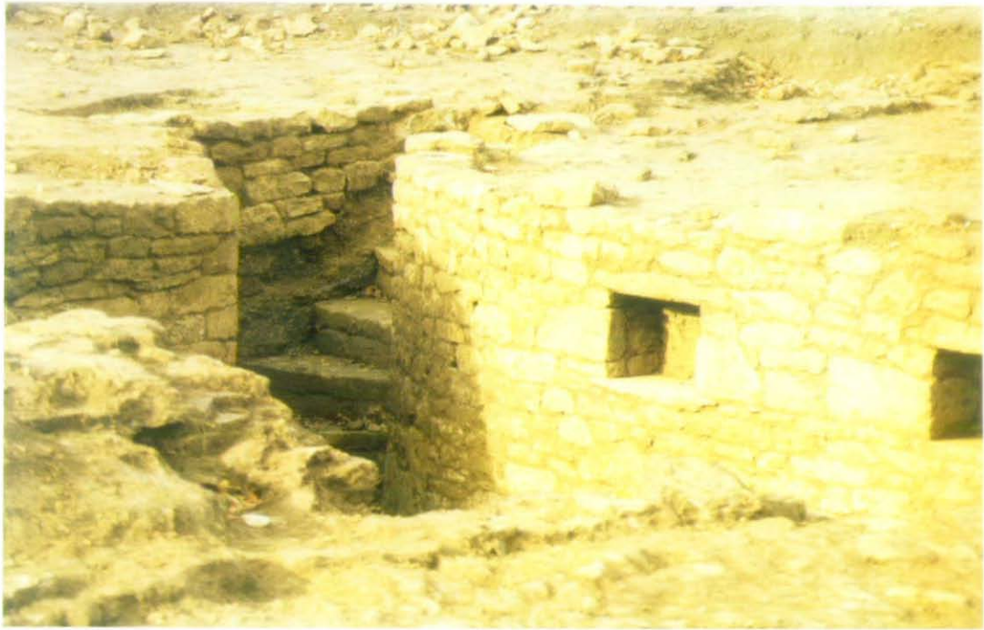
Plate XXIV. Cellar with stairs as in fig. 2 on p. 418. [Adderbury p. 417]