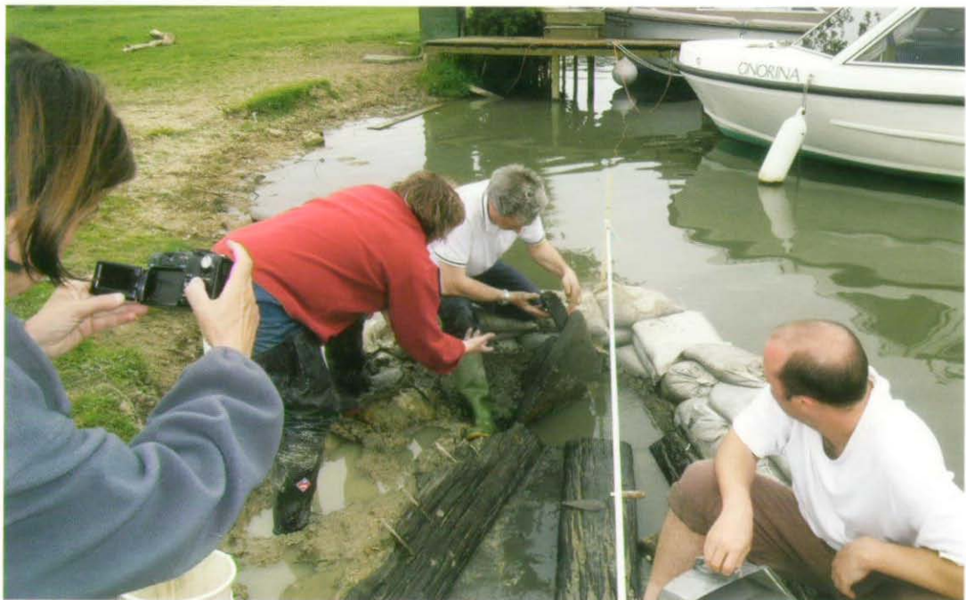
Plate XXV. Port Meadow Boat Trench 1 from north: timber sampling by English Heritage specialist staff. Behind are the modern moorings that may be affecting flow. [Durham p. 435]

Published in Oxoniensia 2006, (c) Oxfordshire Architectural and Historical Society