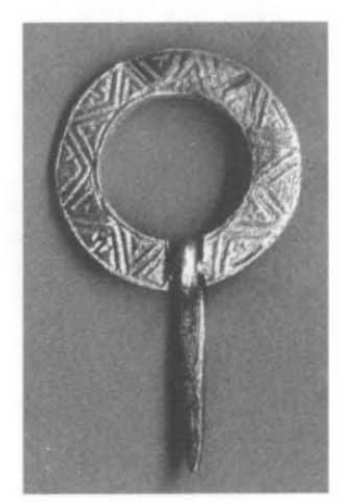
Fig. 3. Silver brooch from Upperton, Oxfordshire.

The brooch<sup>5</sup> was found by Mr A. Irvine in September 2001 at Cadwell Farm, Upperton village, Brightwell Baldwin. The 12 mm.-diameter pure-silver brooch with intact silver pin is decorated with engraved chevrons illustrating a late use of this Romanesque decorative form. The type suggests a 13th-century date. The chevrons may once have been picked out with niello , a sulphide of silver and copper.