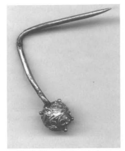
Fig. 6. Silver-gilt dress-pin from Cholsey, Oxfordshire.

This seems to be a de luxe version of a great farthingale pin used for pinning heavy silks into position over the farthingale frame.<sup>13</sup> The long or 'great' pins required for such heavy fabrics were put under considerable strain. The pin is bent at right angles at approximately the mid point along the shaft, perhaps the result of this strain, or possibly deliberately as a superstitious offering ('killing' it – pins were bent and thrown into 'pin-wells' until recently and the practice may still persist), which would account for its unusually good condition.