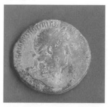
Fig. 1. Wendlebury hoard coin number 83. Sestertius of Hadrian, AD 119–21, mint of Rome. RIC II, 414 no. 583(a).

Roman coin hoard from Wendlebury (Fig. 1)