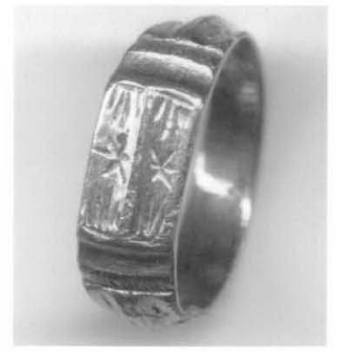
Fig 4. Silver-gilt ring from Radley, Oxfordshire.

The appliqué (or button) was almost certainly one of a suite of similar jewels sewn to a luxurious garment, a type well known from portraiture: the white, red and black enamelled buttons which decorate the gown and doublet of an unknown lady, possibly painted by William Seger c. 1593-5, may be noted.10 These very rarely survive in quantity save in exceptional circumstances like the remarkable assemblage of dress jewels from Hall near Innsbruck.<sup>11</sup> Such jewels would in all cases have related to people of very high status. As for the possible owner, it may be noted Bletchingdon Hall was owned in the Elizabethan period by the wealthy Annesley family.