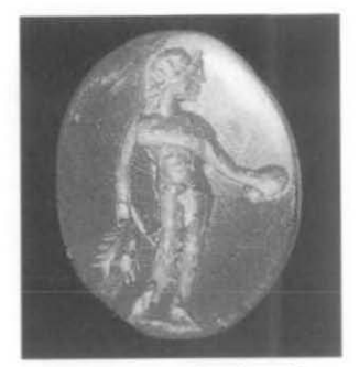
Fig. 1. Cornelian intaglio depicting Bonus Eventus , the male personification of rustic prosperity.

The gem has a slightly convex upper surface and sides, which bevel inwards. It measures 9 mm. by 7 mm. and is some 3 mm. in thickness. The build of the figure is chunkier than that of the Frilford Bonus Eventus . He carries in his right hand two ears of corn, the glumes of which are clearly indicated; the patera in his outstretched left hand is shown simply as an ovoid blob.