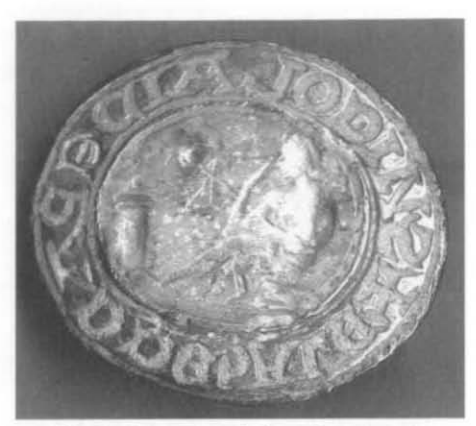
Fig. 2. Gem-set seal from Crowmarsh, Oxfordshire.

Roman gems were quite frequently reused in seals between the 12th and 14th centuries, partly because of the high value placed on them in contemporary lapidary books.<sup>4</sup> Roman gems were traded across Europe and reused not only in seals and rings but in shrines in churches, abbeys and cathedrals, so the gem was almost certainly not found in Britain.