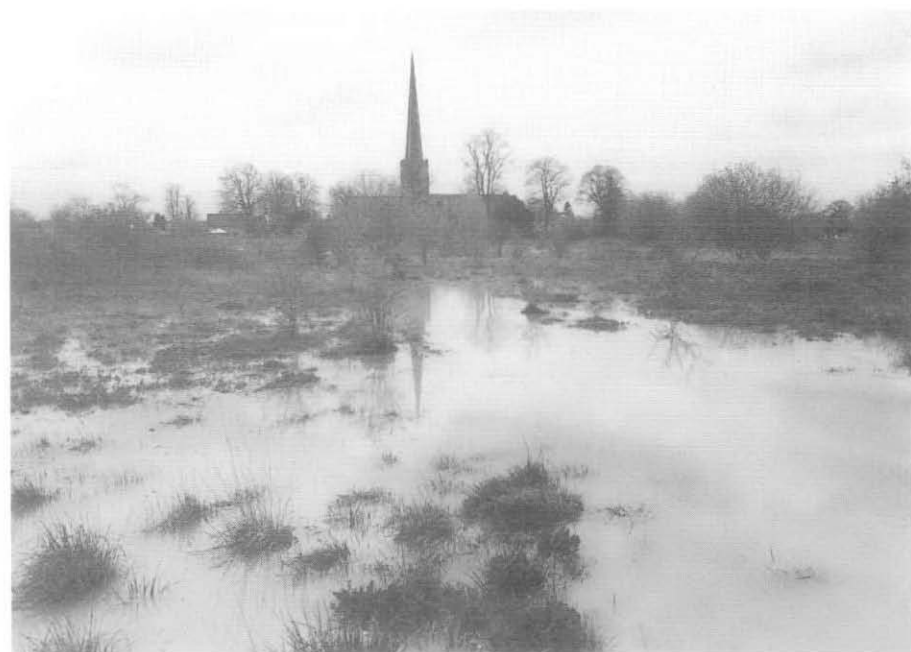
Fig. 5. The moated site during exceptionally severe floods on 11 April 1998, when large areas of the site (the 'enclosed garden') were under water, as well as the entire area between the Cherwell and the moat. The church is still well above flood-level.