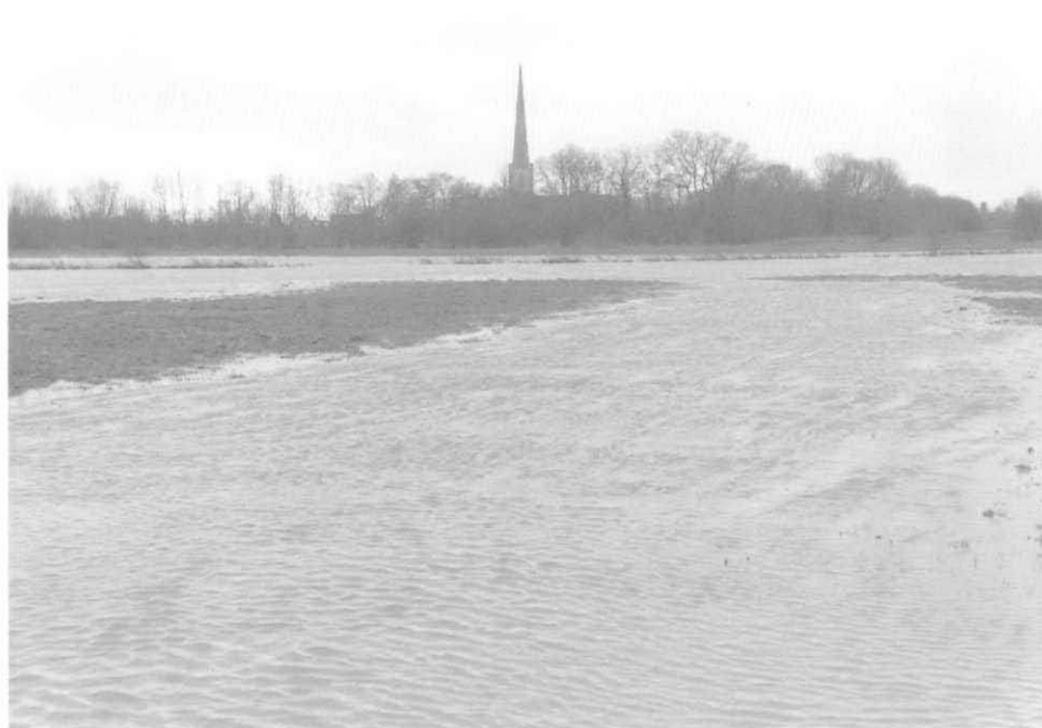
Fig. 3. Much of the area between the Cherwell and the moated site, whose W. and N. sides are marked by the line of trees visible in the background, is submerged (8 January 1998).