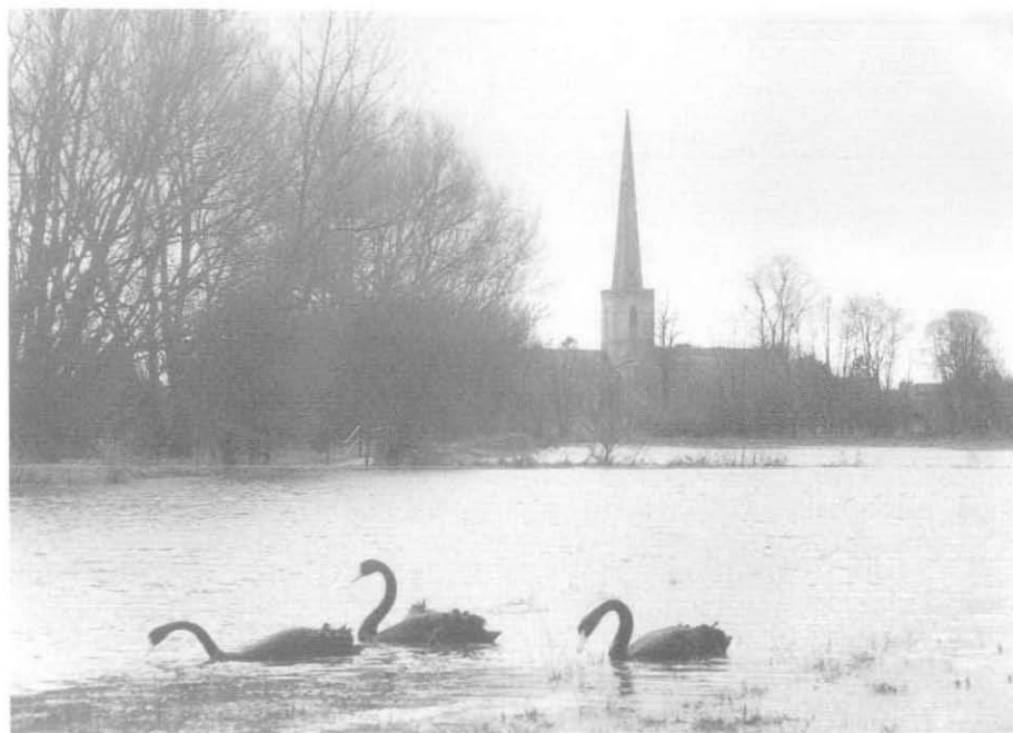
Fig. 4. The moated site between the church and the row of trees (centre right), and most of the footpath (left) to the footbridge over the Cherwell, are just above water level. (Photo taken on 9 January 1998 when the floods were no longer at their peak.)