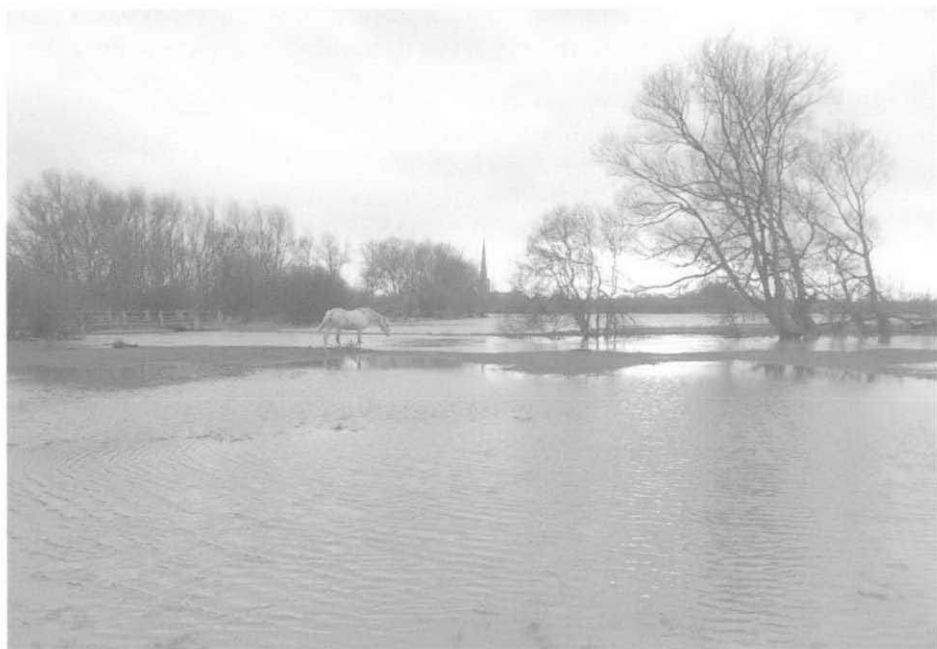
Fig. 2. The meadows between Hampton Poyle and Kidlington, an area avoided by medieval and modern settlement, during winter floods (8 January 1998). The footbridge over the River Cherwell is on the left, St. Mary's church in the background.