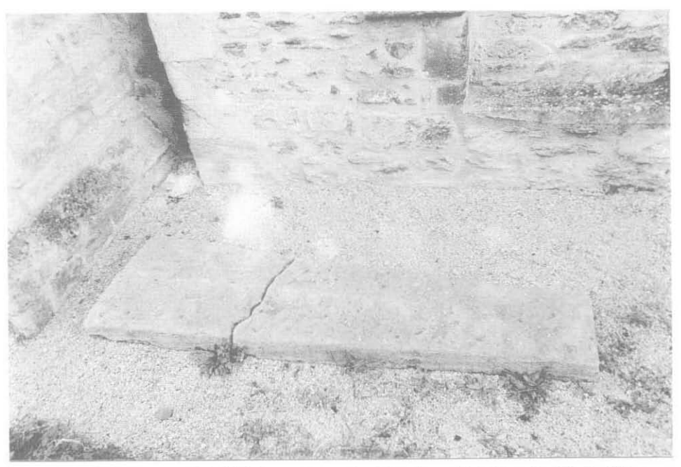
Fig. 4. 13th-century coffin lid lying to the south of the chancel, St. Mary the Virgin, Iffley.