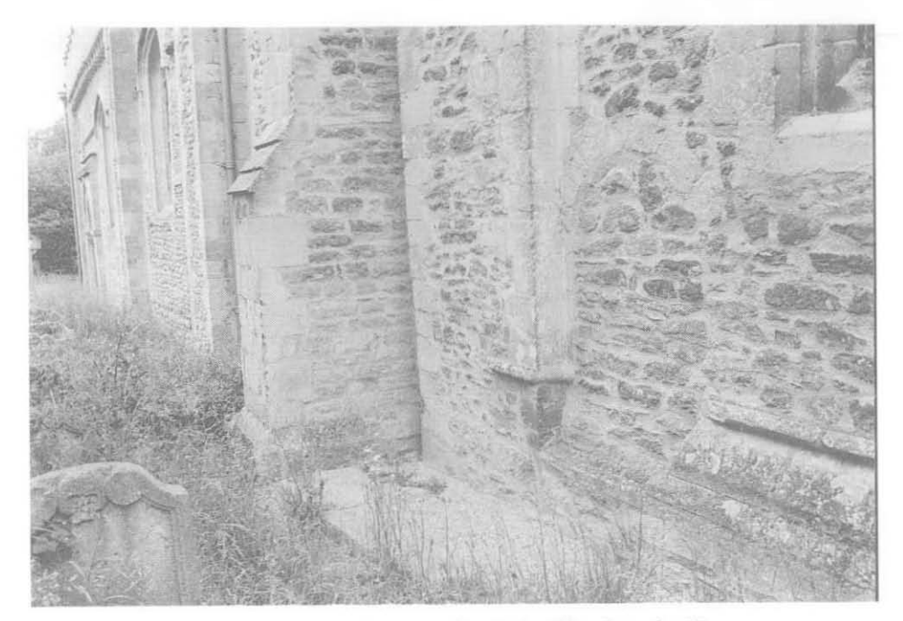
Fig. 3. Church of St. Mary the Virgin, Iffley, from the SE.