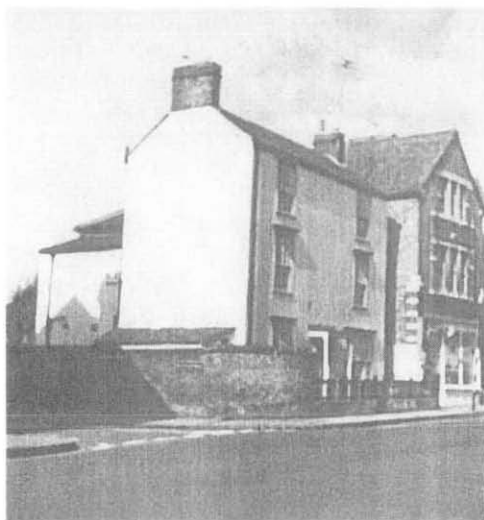
Fig. 2. View from the SE. of the house at no. 73 Walton Street prior to the demolition and rebuilding in 1991 of the 3-storey timber-framed building fronting the street. The 19th-century brick-built extension visible at the rear of the house was retained.