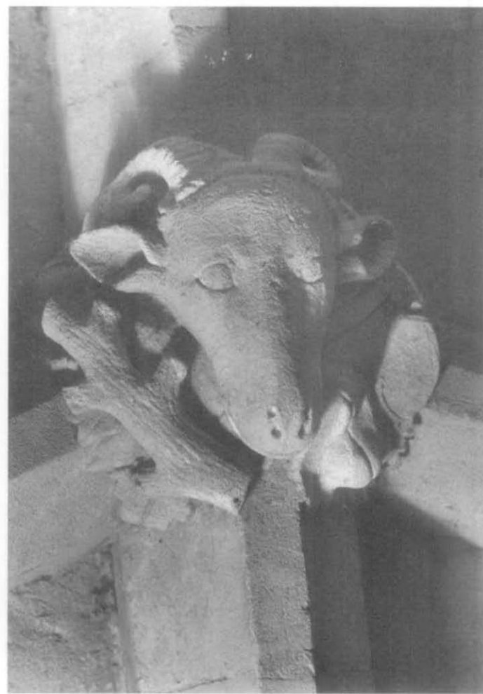
Fig. 2. Bosses inside Merton College gatehouse.