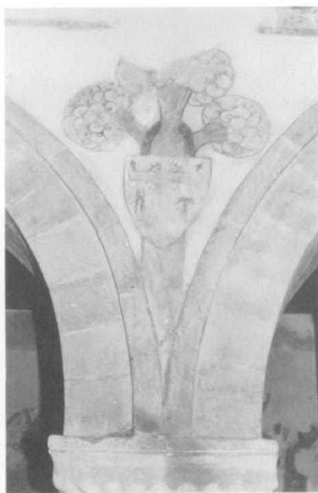
Fig. 2. Top : Concluding part of the Passion cycle, including (probably) the Entombment, and the Resurrection. Bottom : the central Trinity Tree, with shield showing Instruments of the Passion. (Ph. J. Edwards).