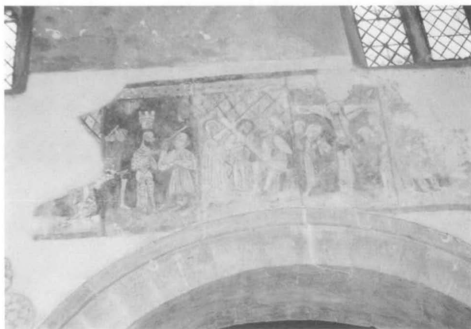
Fig. 1. Parts of the Passion cycle, including (top) Christ's entry into Jerusalem (with the westernmost Trinity Tree visible beneath), and (bottom) the Flagellation. (Ph. J. Edwards).