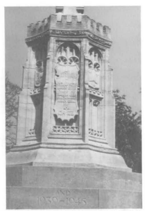
Fig. 2. Left: Oxford war memorial as executed. Right: the octagonal pedestal, with dedication, flanked by the City's and the University's arms.