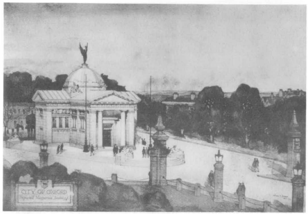
Fig. 1. Proposed memorial building, to be erected in front of St. Giles' church (Builder, 6 June 1919).

building would have sat ill in this part of Oxford. A sketch (Fig. 1) was published in the Builder of 6 June 1919 but, by the time this appeared, St. John's College had already tactfully indicated that it would not approve the erection of a building which would block the view of St. Giles' Church. The college favoured the Committee's alternative suggestion, 'a large granite cross', and would 'gladly place the ground on the south side of the church at the disposal of the City for the erection of such a memorial, as a free gift'.<sup>3</sup>