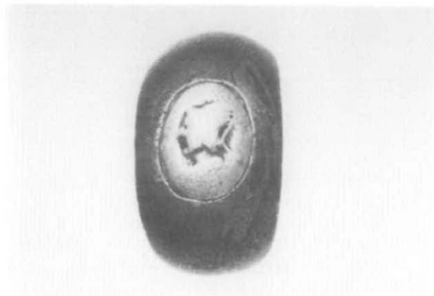
Fig. 1. Silver ring with inset bezel 'from near Wendlebury' (Alchester?) Scale: 2:1

much the vogue, and were often works of great elaboration such as the openwork ( Opus Interrasile ) gold ring from Oppen bei Merzig near Trier, incidentally set with a relief figure of the seated Roma. 7 Instead of flimsy metal settings gold and silver coins were sometimes used, which some economic historians ascribe to the process of 'thesaurisation', though a much more 'flashy' taste is probably at least as important as the urge to keep part of one's material wealth on one's finger or around one's neck. 8 The visual effect of these coins set in the bezels of rings was virtually the same as on a ring with a specially manufactured setting such as ours.