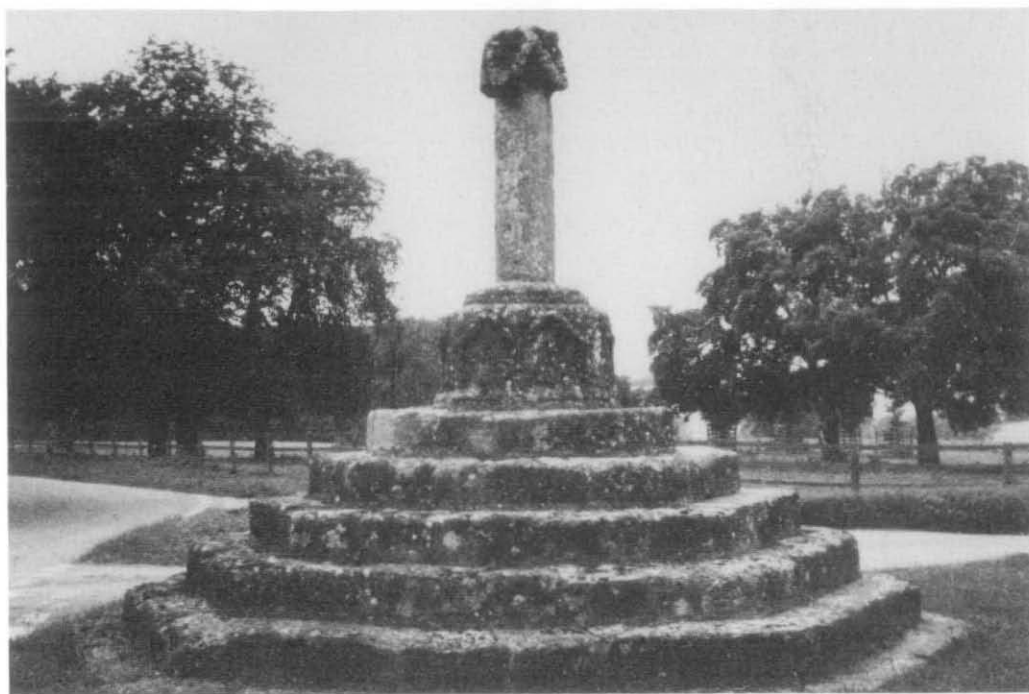
Fig. 2. Sarsden, the 'wayside cross'.

Earlier antiquaries such as Skelton, Brewer, White Kennett, Dr. Plot, Rawlinson and Camden likewise make no reference to the cross. 33