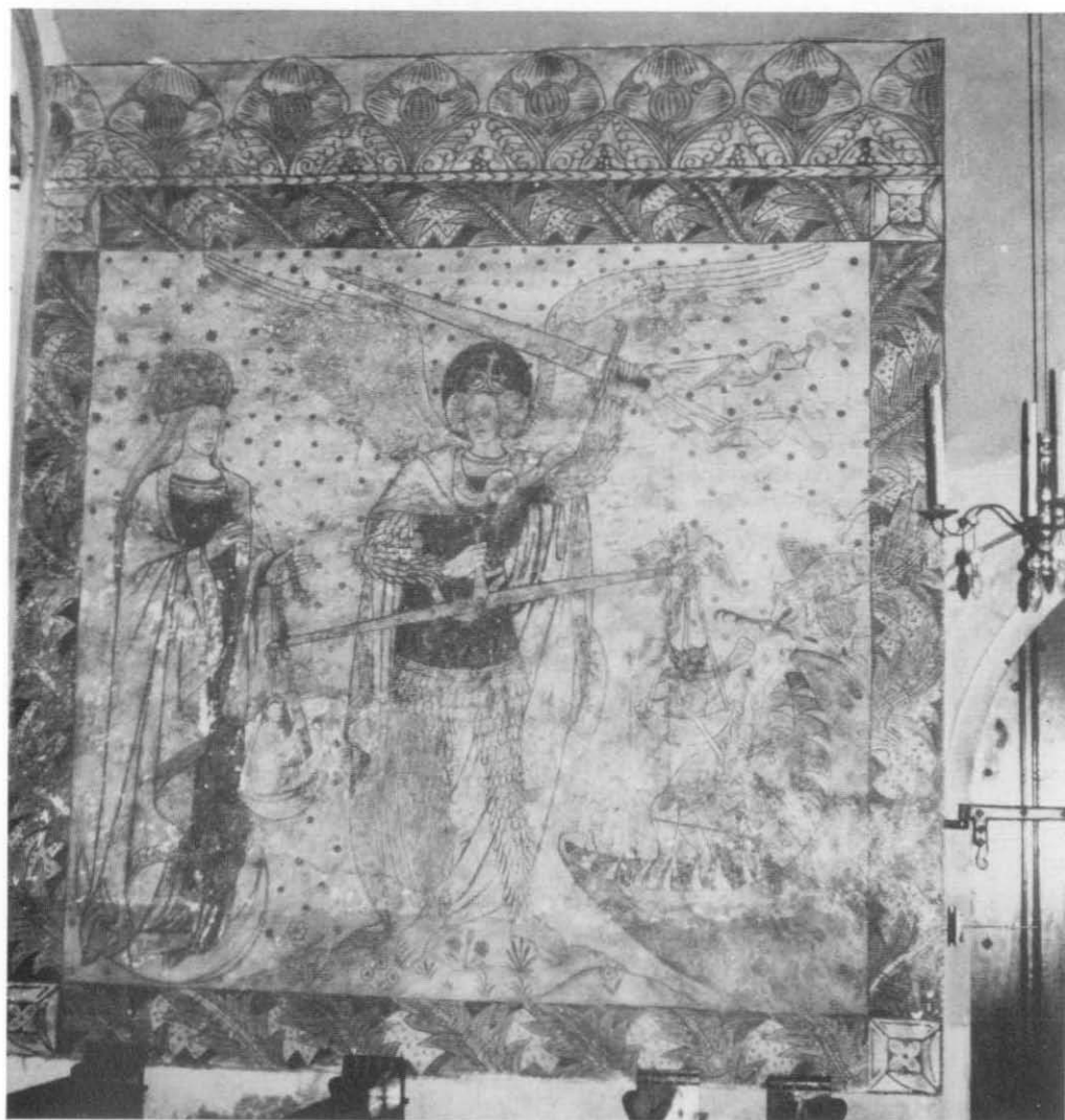
Plate 1. The Soul-Weighing wall-painting at St. James' Church, South Leigh. (1983)

ing his task without interference. The majority of the surviving wall-paintings in England of this subject were, however, made after the Golden Legend had appeared and thus show souls being saved because the Virgin was prepared to intervene on their behalf, usually by placing her rosary on the soul's side of the scales and so miraculously out-weighing both his evil deeds and the machinations of the devils seeking to claim the soul for their own. Thus are Soul-Weighings portrayed in late medieval wall-paintings which the present writer has seen in six churches and one former medieval hospital. Perry points out that though intercession is usually confined to the Virgin, this is not invariable, and she refers to a wall-painting at Preston, near Brighton, where the function of intercession is 'probably'