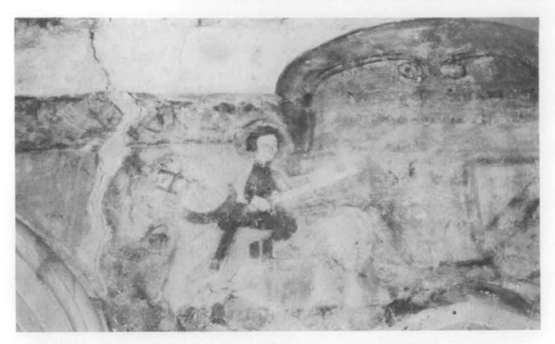
Plate II. St. Martin, Chalgrave, Bedfordshire (1976); wall-painting.