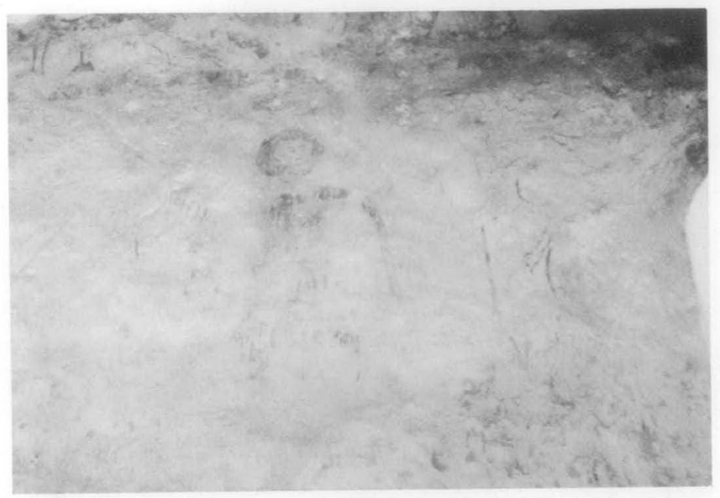
Plate 1. Wall-paintings on the south wall of the chancel at Widford Church, with St. Martin and the beggar in the middle (1981). What appears to be a second horse's head, to the left of that of the saint's horse, is an illusion caused partly by dust on the ridges in the plaster and partly by shadows thrown by the flash; only one of the 'lines' is actually painted.