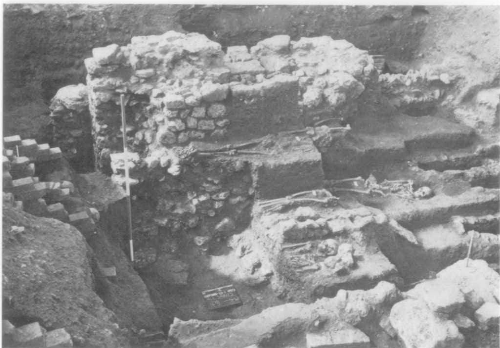
A. Oxford, All Saints Church. View from the north of the east end (F49) of the first north aisle, showing the robber trench cutting graves and unrobbed masonry incorporated into the pier base. Scales = 2m.