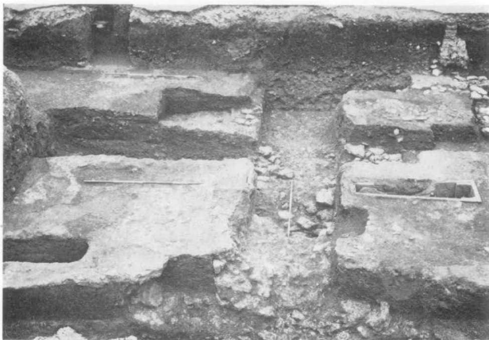
A. Oxford, Blackfriars. Trench II, view from the north showing the junction between the extended western bay of the nave and south aisle of the Church (left) and the northern end of the cloister, and also the corridor with burials which separated the church from the free-standing building to its west (right). Scales = 2m.