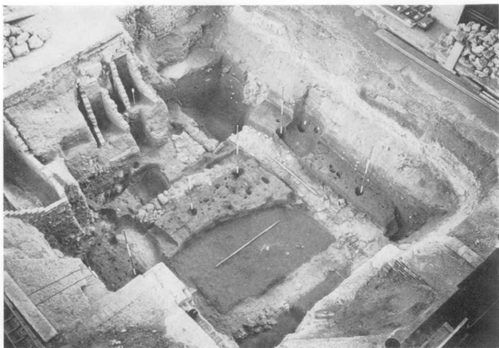
A. Oxford, All Saints Church. The excavation from the north-west. The original topsoil is visible in four places, pock-marked by late Saxon post-holes and stake-holes. The large cellar pit is unexcavated. The south section (top right) shows late Saxon yard surfaces and a pit, a layer of graves within the medieval church, and the rubble podium of the 18th century church. Scales = 2m.