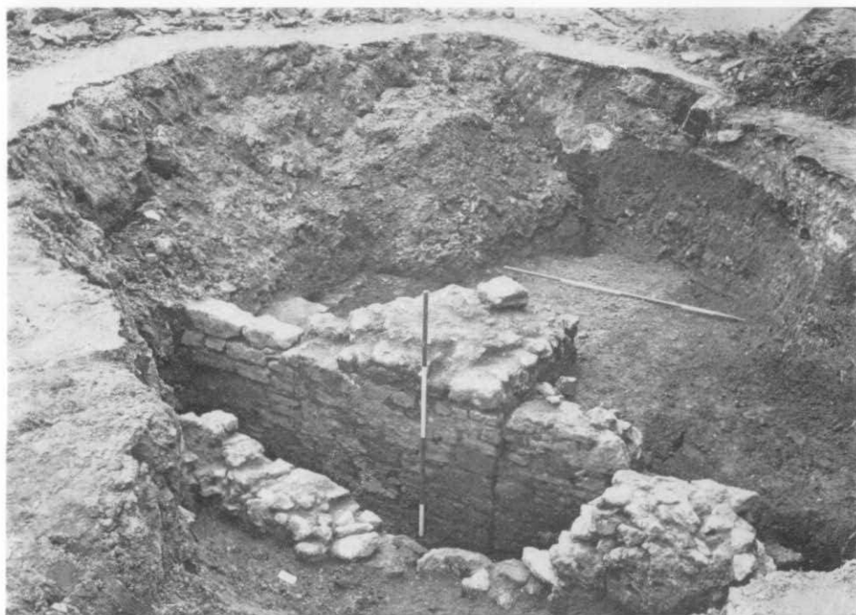
B. Oxford, Greyfriars. View from the north of the culvert in the claustral area. Scales = 2m.