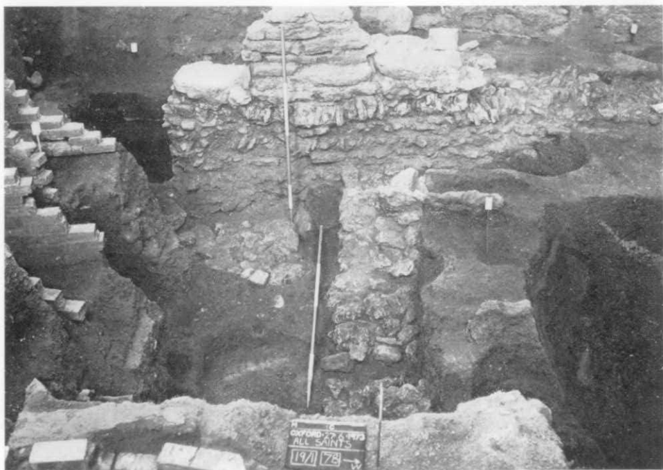
B. Oxford, All Saints Church. The north face of the pitched stone footing (F78) from the north, with its rough-faced wall on top (F19/1), which had been concealed within the pier base. Scales = 2m.