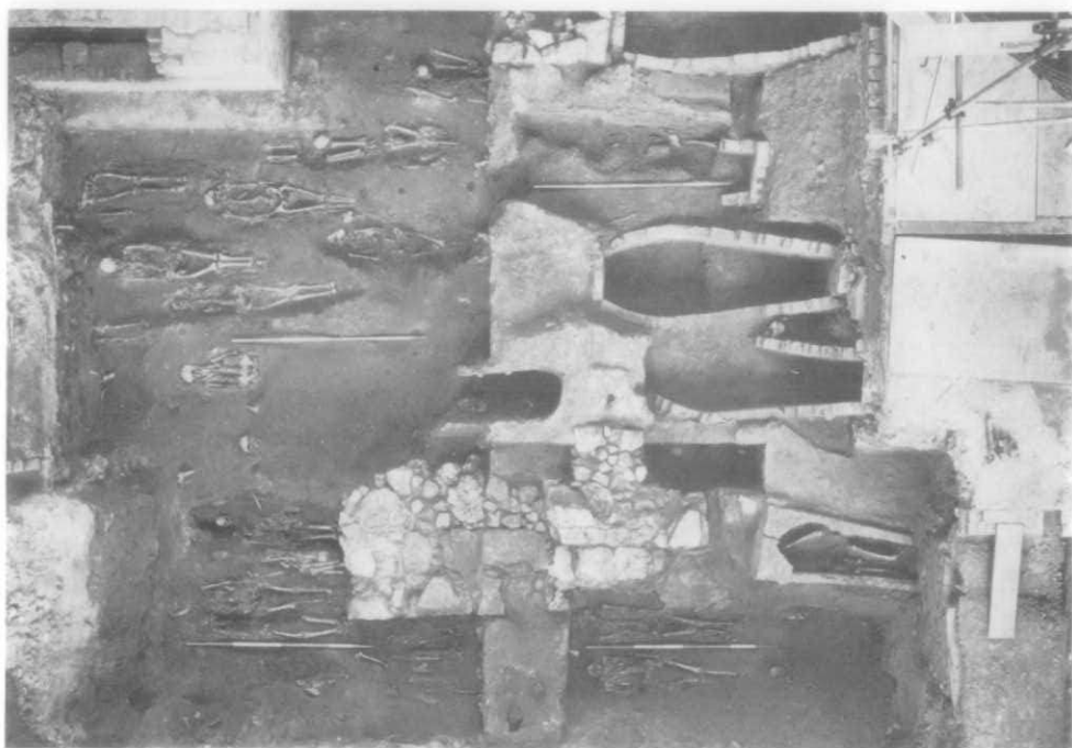
B. Oxford, All Saints Church. Vertical view of the controlled excavation with north at the top of the plate. The pier base of the phase 8-9 Chancel arch is at lower centre surrounded by 19th century brick vaults, medieval graves and a medieval stone coffin (bottom right). Scales = 2m.