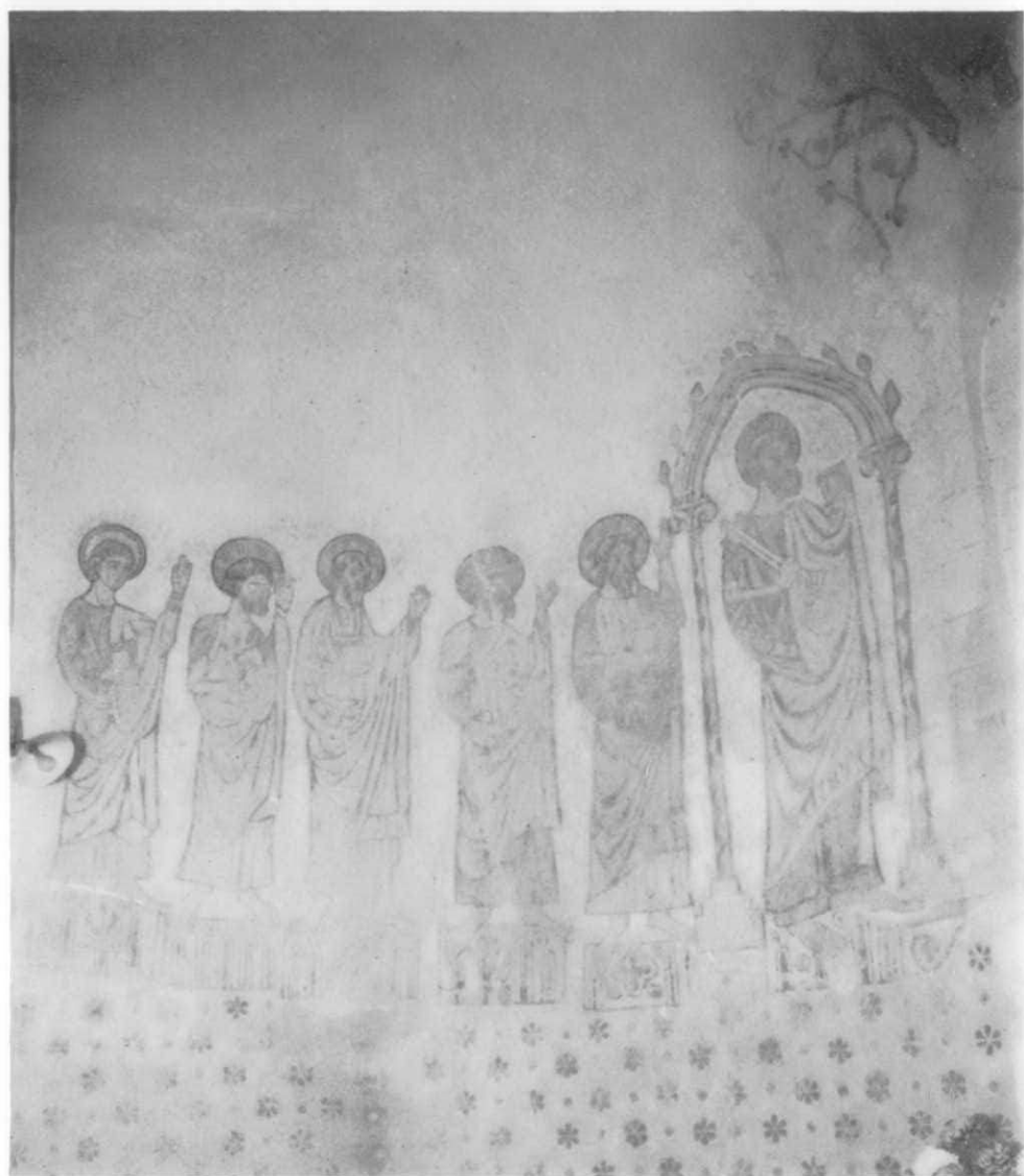
Checkendon, St. Peter and Other Apostles.