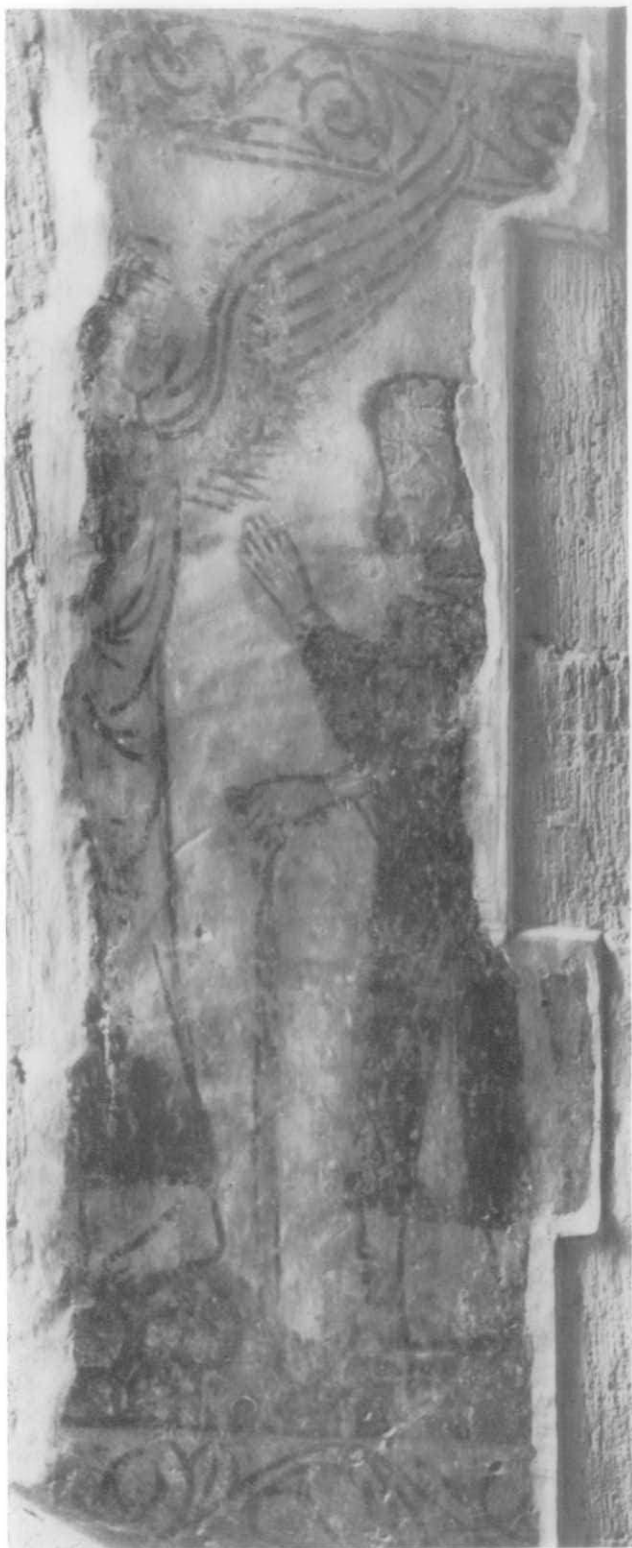
Blackbourton, Appearance of an Angel to St. Joseph.