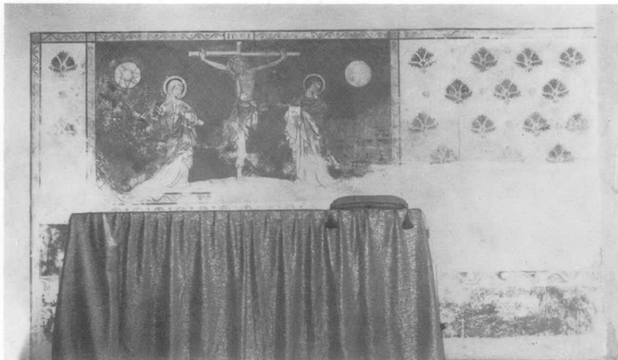
Dorchester, Crucifixion in South Aisle.