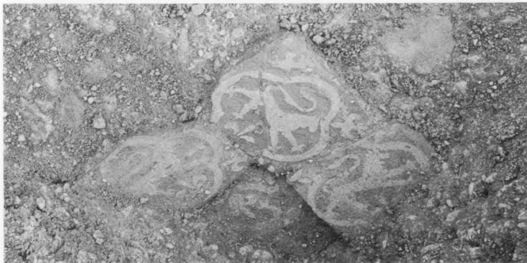
B. Godstow, Oxford. Second group of tiles for the pavement. Each tile is 5\frac{1}{4} inches square.