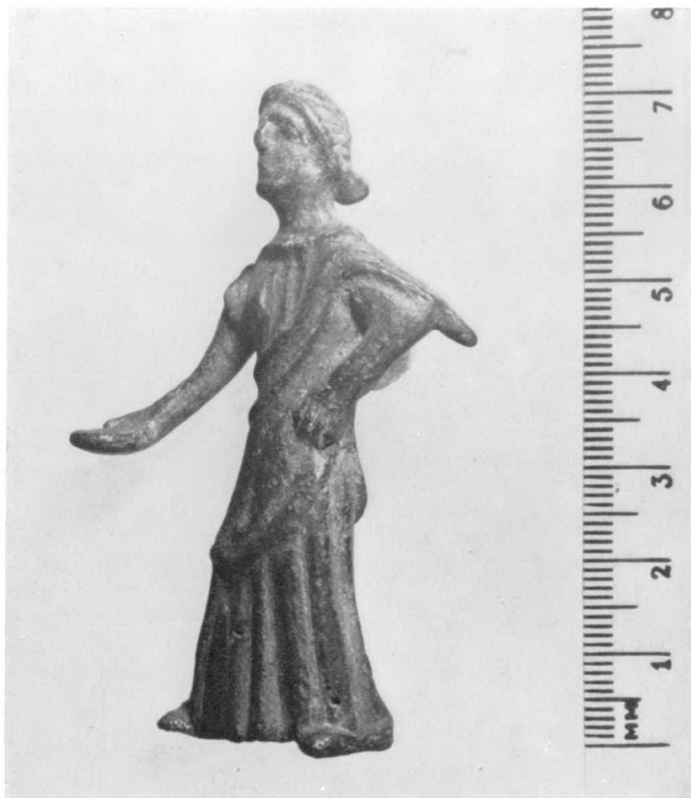
Female figure cast in bronze, perhaps from Woodeaton.