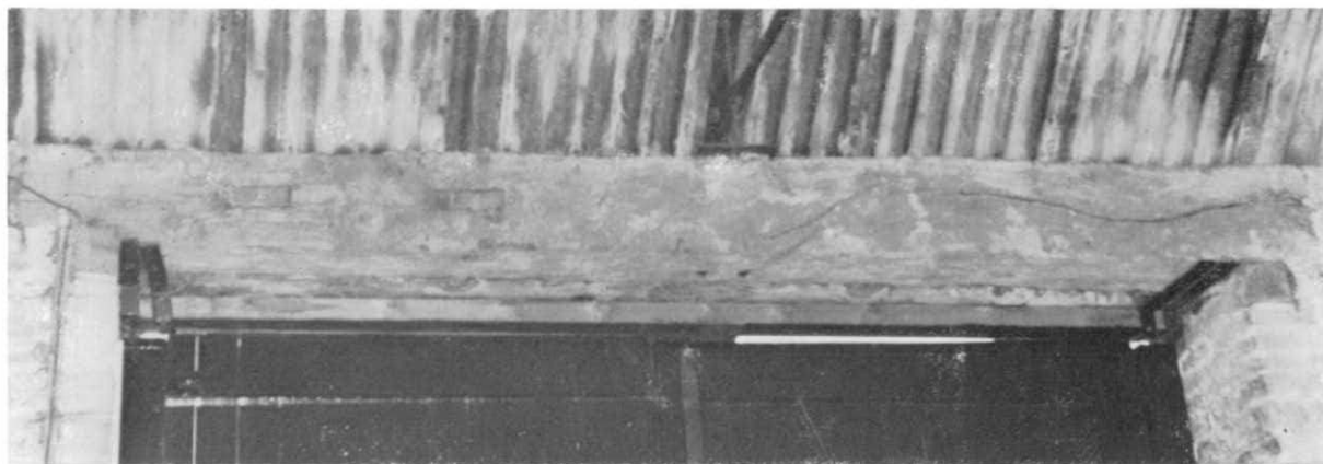
A. Principal post used as lintel at S. door of barn.