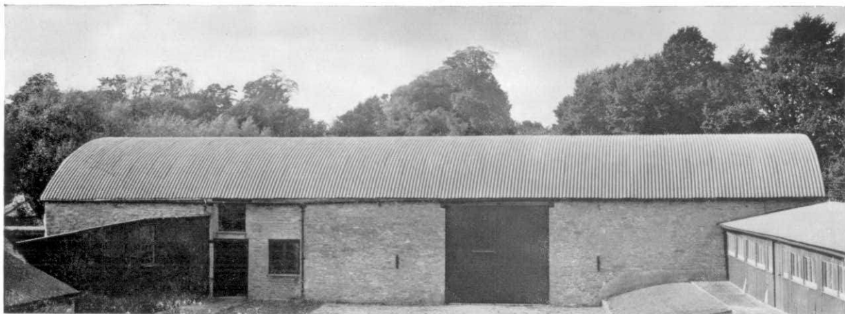
A. Shilton Barn from the Old Manor, looking East. The smaller door and windows are contained in an original door-opening.