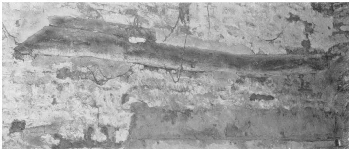
B. Heavy raking strut set into N.E. Gable Wall.