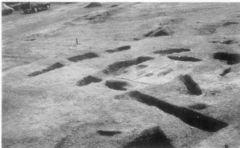
NEW WINTLES FARM, EYNSHAM Oval complex of ditches and pits, p. 104.