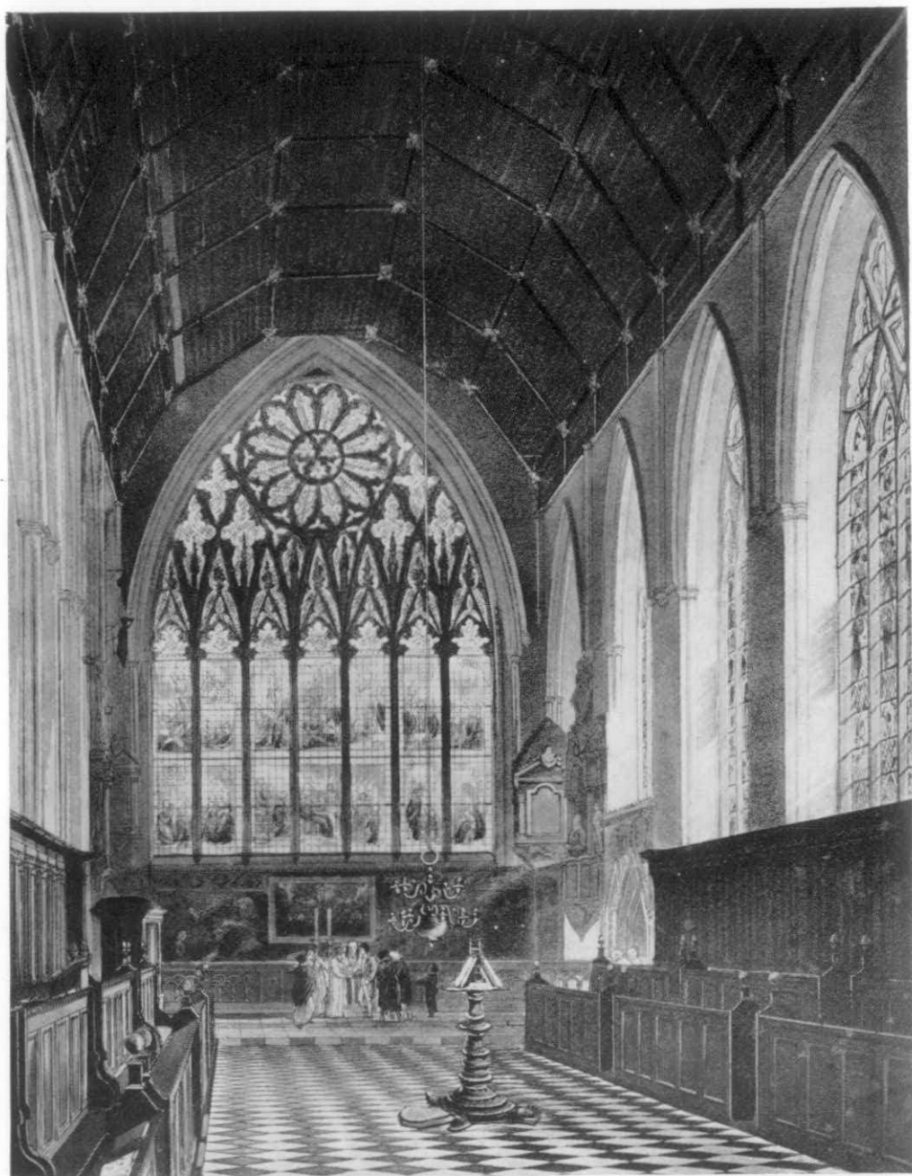
THE WREN STALLS, MERTON COLLEGE CHAPEL. From Ackermann, History of the University of Oxford (1814).