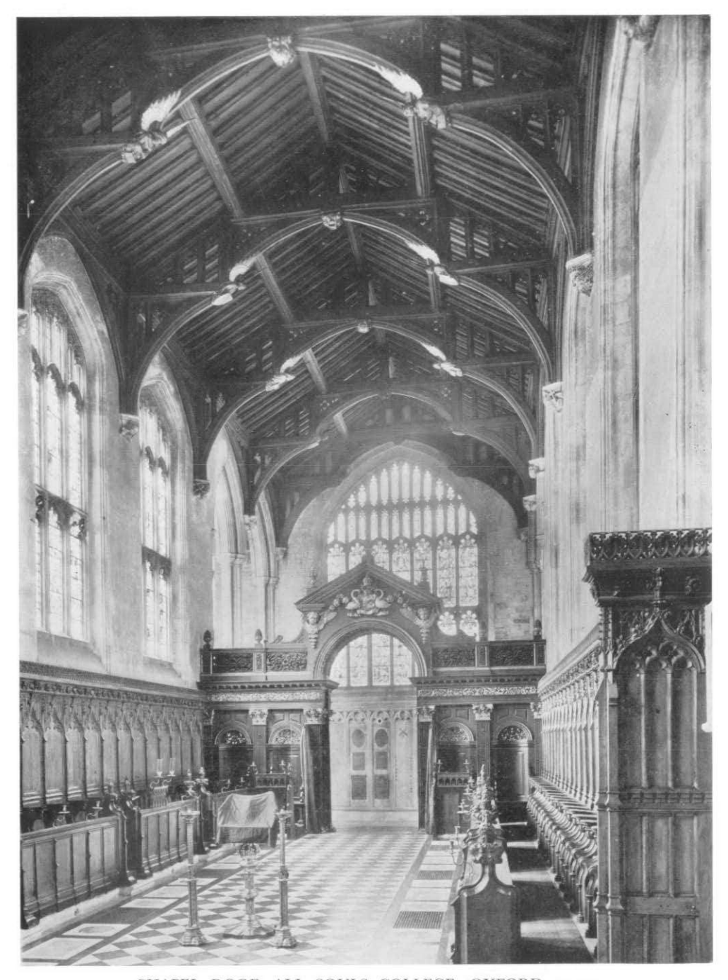
CHAPEL ROOF, ALL SOULS COLLEGE, OXFORD, 6.1440