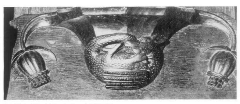
CARVED MISERICORDS IN THE CHAPEL, MAGDALEN COLLEGE, OXFORD, {\scriptstyle 1521-2}