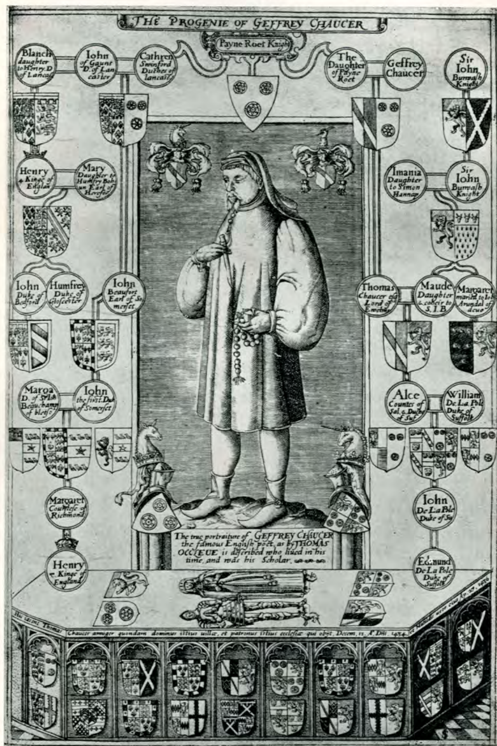
Frontispiece of Thomas Speght's Edition (1598) of 'The Workes of our Antient and learned English Poet Geffrey Chaucer' (p. 78).